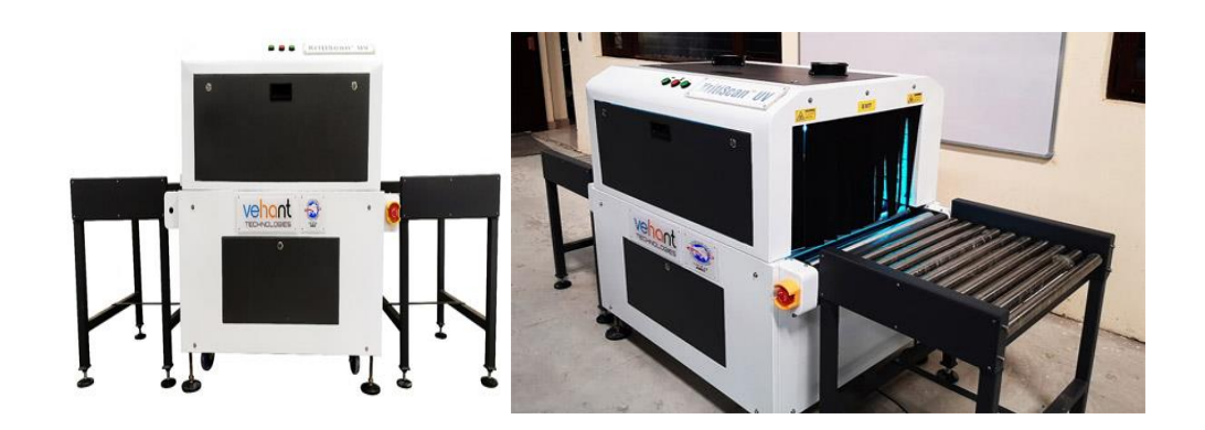
KritiScan® UV - Baggage Disinfection System